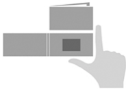
2.4" Screen Video Business Card